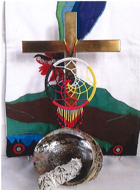
Life and Work of First United Church