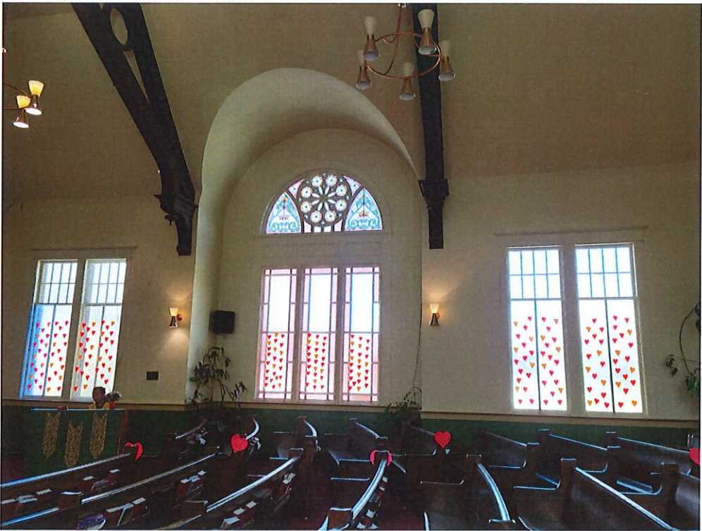
Front Cover photo courtesy Derry Bott, Back Cover Miranda Kessler